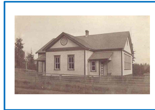
Chemainus Superior School, c. 1937