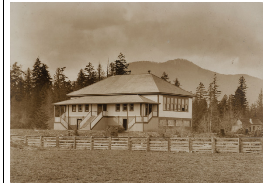
Duncan High School, 1912

Image 1993.01.2.2 courtesy of the Cowichan Valley Museum & Archives