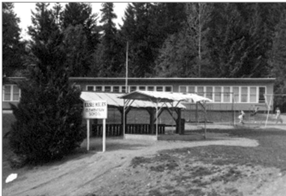
Elsie Miles School, c. 1975