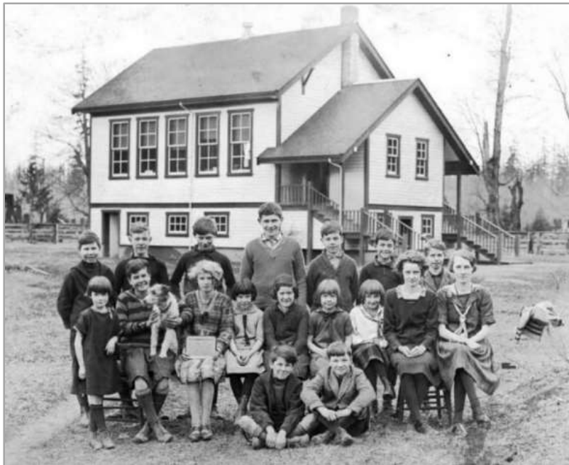
Second Westholme School, 1927

30. Crozier Road School Built as a two-room school in 1961. First teachers were Don Fitch, Principal, and Molly Stringer. Closed 1984. Sold in 2003 for $300,000 to Mount Brenton Golf Course. Original structure absorbed into golf course maintenance building. Location: north side Crozier Road 50m west from Crozier Road-Chemainus Road intersection.