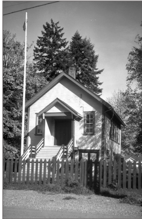
Koksilah School, c. 1960