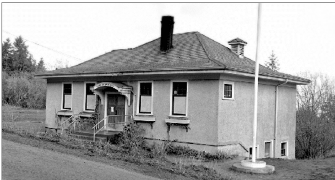
Bamberton School. c. 1933