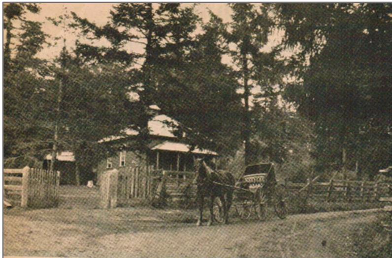
Quamichan School. C. 1907