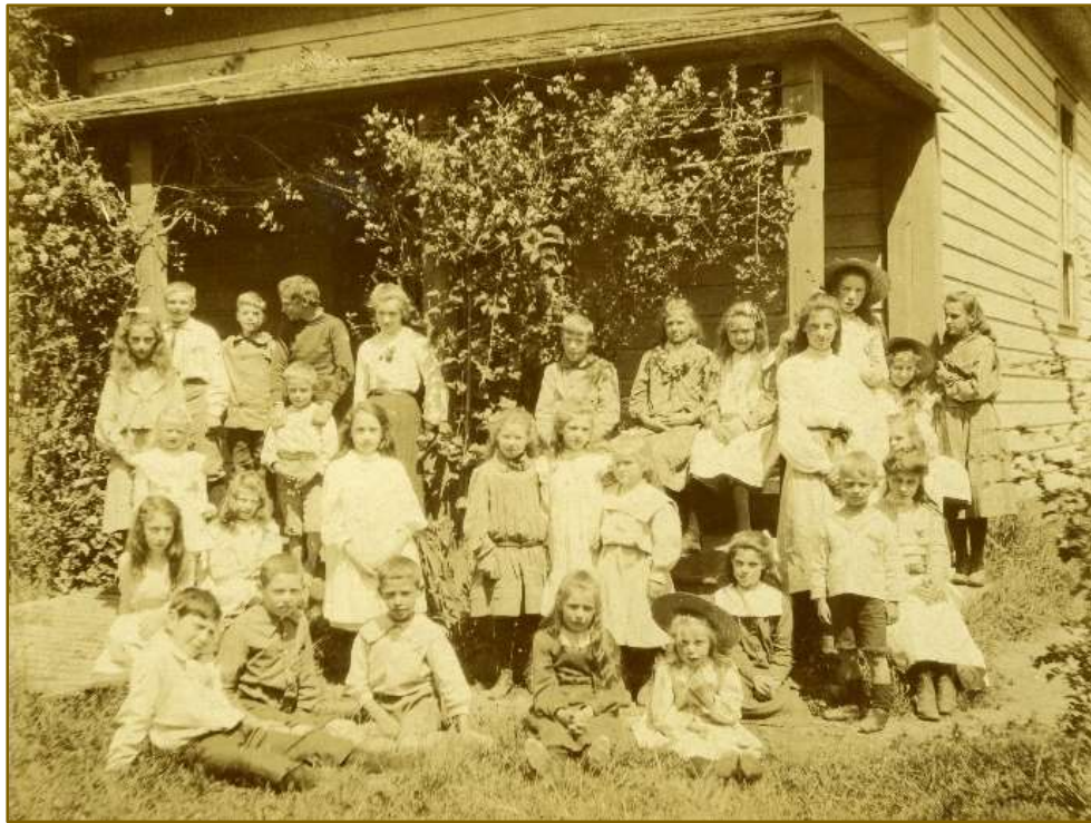
First Maple Bay School, 1905