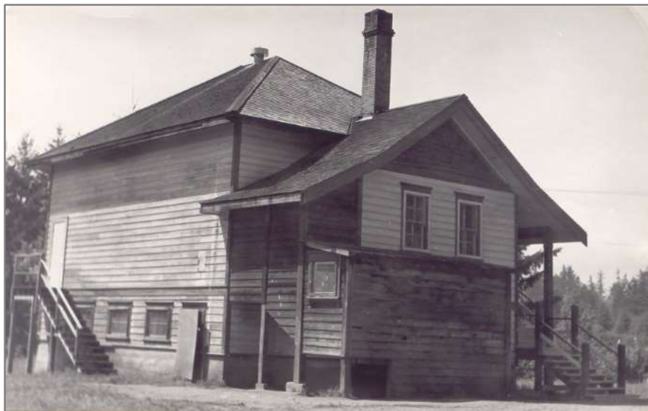
Third Somenos School. c. 1950