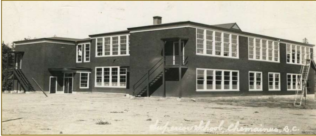
Fourth Chemainus School, c. 1938