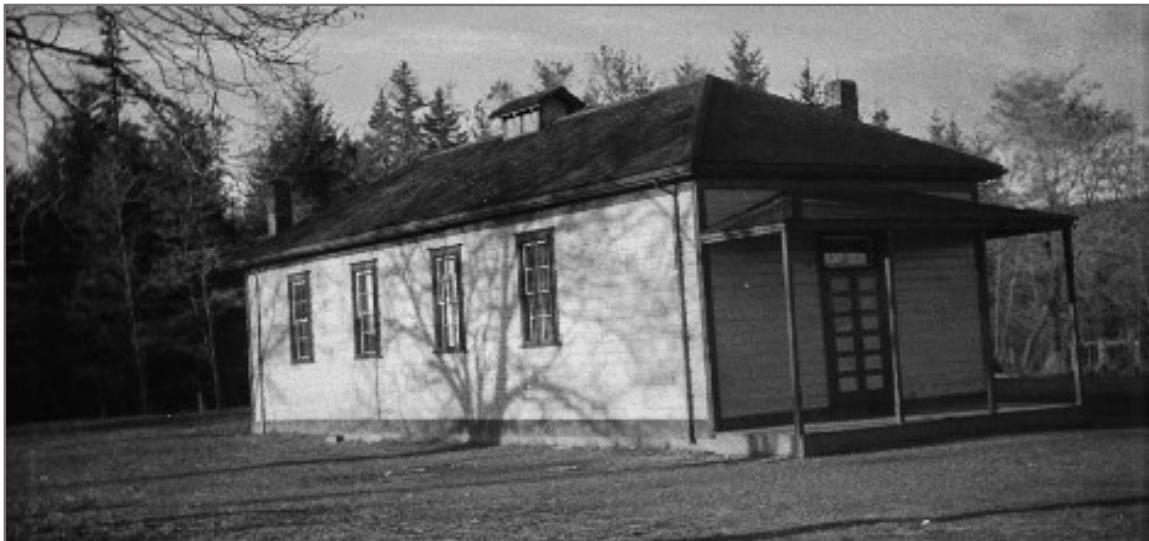
3 rd Bench School, c. 1949

42. St. Ann's Convent School Opened 1864 as school for First Nations girls on land pre-empted by the Sisters of St. Ann at the foot of Mount Tzouhalem. Became boys' school 1904. Original schoolhouse replaced 1921. Girls readmitted as day students in 1950 and boarding school for boys was discontinued in 1956. Closed permanently in June 1964. Location: 1843 Tzouhalem Road, Duncan.