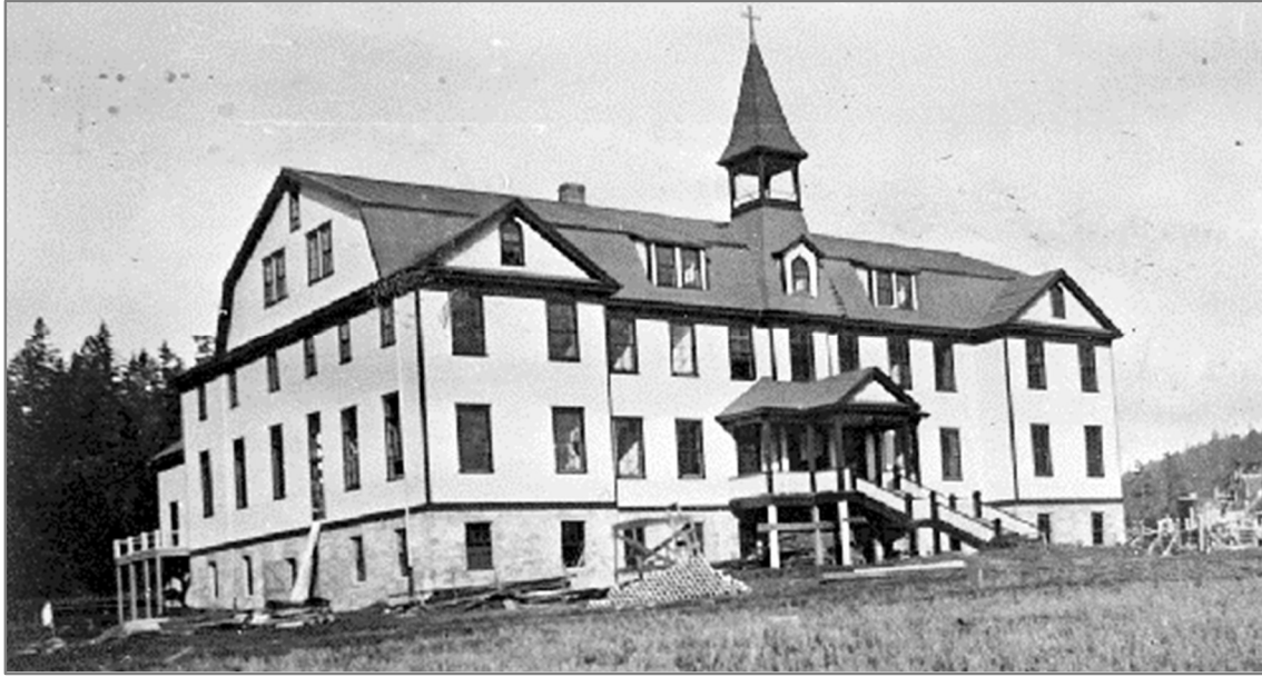
St. Ann's Convent School, 1921

42. St. Ann's Convent School Opened 1864 as school for First Nations girls on land pre-empted by the Sisters of St. Ann at the foot of Mount Tzouhalem. Became boys' school 1904. Original schoolhouse replaced 1921. Girls readmitted as day students in 1950 and boarding school for boys was discontinued in 1956. Closed permanently in June 1964. Location: 1843 Tzouhalem Road, Duncan.