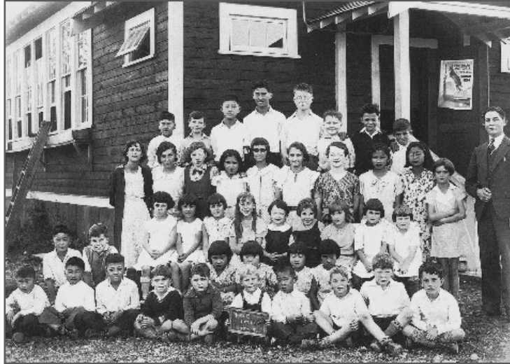
Mt. Prevost Hillcrest School, 1934