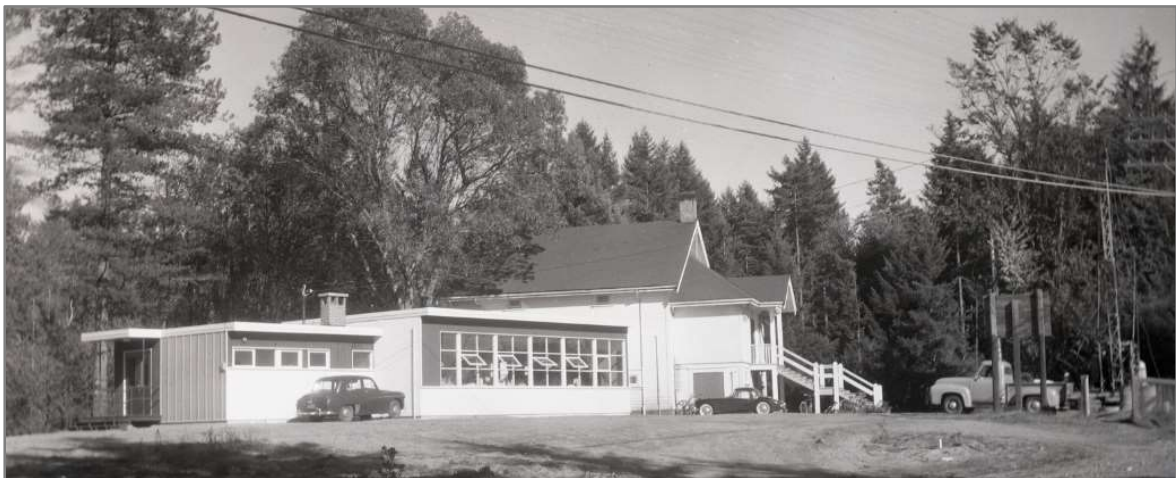
4 th Mill Bay School, c. 1950