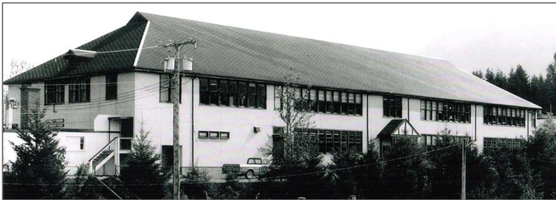
Stanley Gordon School, c. 1970