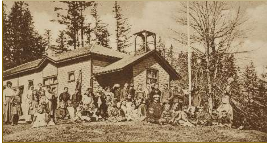
Duncan Public School (aka Alderlea), c. 1900