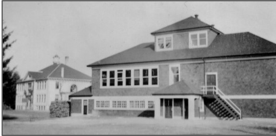
Duncan High School on the right, c. 1942 (Duncan Elementary School in background)