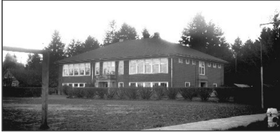
Cairnsmore Primary School, c. 1940