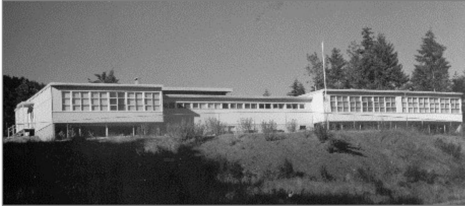
Maple Bay School, 1962

37. Second Maple Bay School Four-room public school opened 1961 with 161 students in grades 1-7. Two more classrooms and a gymnasium added in 1963. Closed in 2000. Property sold. School building now serving as private museum. Location: 6759 Considine Road in Maple Bay.