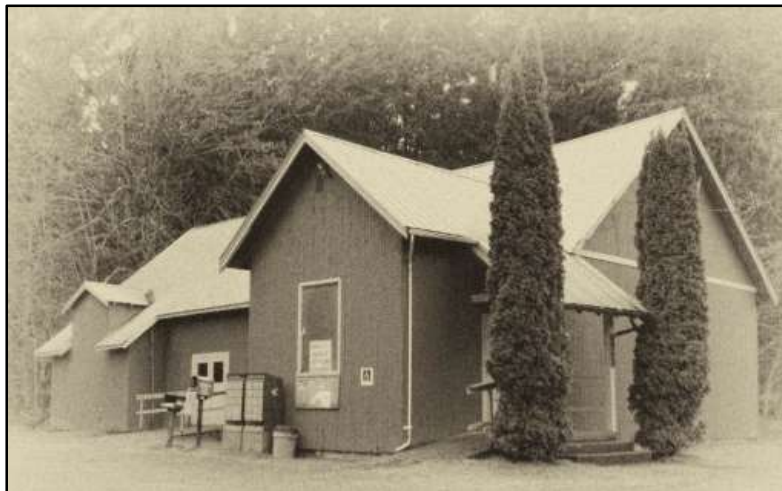
Vimy Hall, c. 2015

11. Gibbins Road School Opened 1962 as three-room annex of Duncan Elementary School for students in grades 1-7. Later used for grade 4 only. Closed permanently 1983. Property now owned by the Royal Canadian Air Cadets, Squadron 744. Location: 3790 Gibbins Road, Duncan.