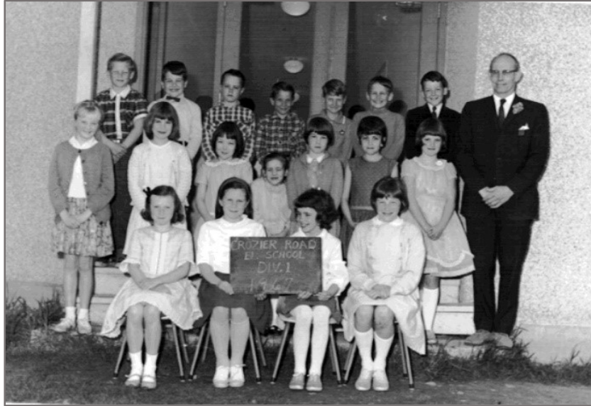
Crozier Road School, 1966

30. Crozier Road School Built as a two-room school in 1961. First teachers were Don Fitch, Principal, and Molly Stringer. Closed 1984. Sold in 2003 for $300,000 to Mount Brenton Golf Course. Original structure absorbed into golf course maintenance building. Location: north side Crozier Road 50m west from Crozier Road-Chemainus Road intersection.