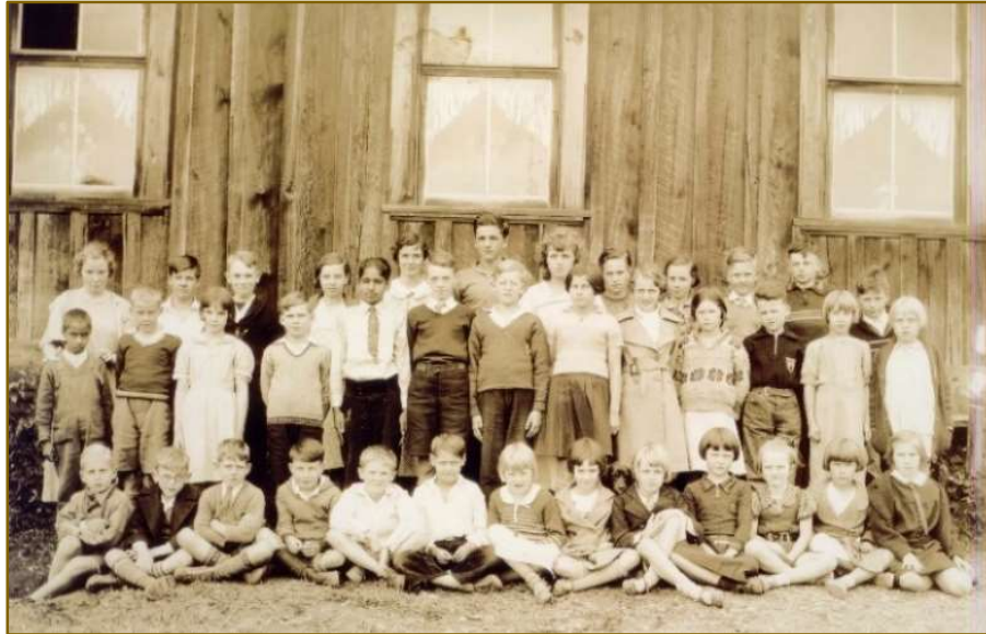
First Yount School. c. 1935