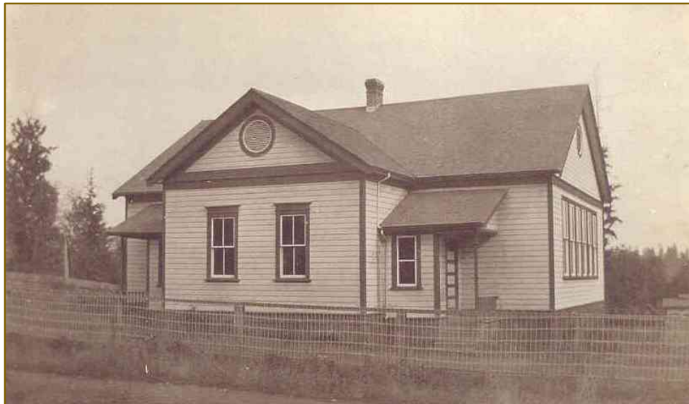
Chemainus Superior School, c. 1937

26. Mount Brenton Elementary School Opened 1885 as Oyster School. Later called Oyster Bay School. New schoolhouse was built 1905. Closed 1934. Re-opened 1948 as Saltair School. In 1950 re-named Mount Brenton Elementary School. Closed in 2002. Property sold 2004. Now last schoolhouse on site serves as Mount Brenton Community Centre. Location: 3850 Oyster School Road, Saltair.