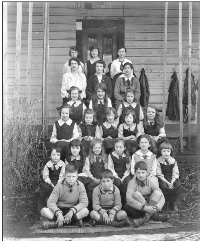
Queen Margaret's School, 1921