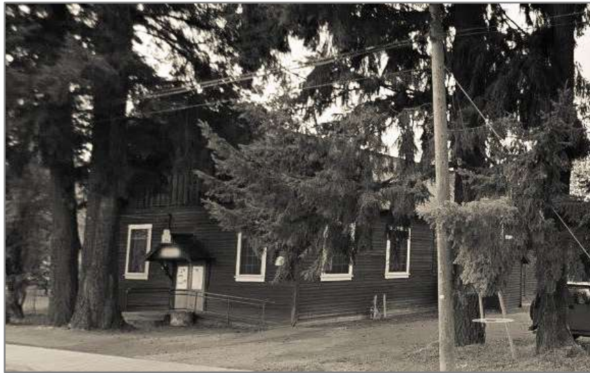
Girl Guide Hall, c. 2015