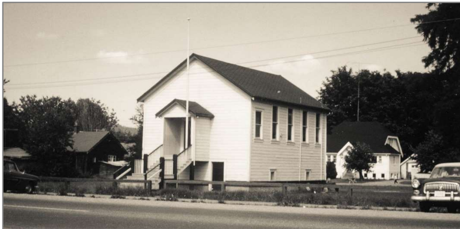
York Road School, c. 1972

Look for the gold school-bell shaped signs!