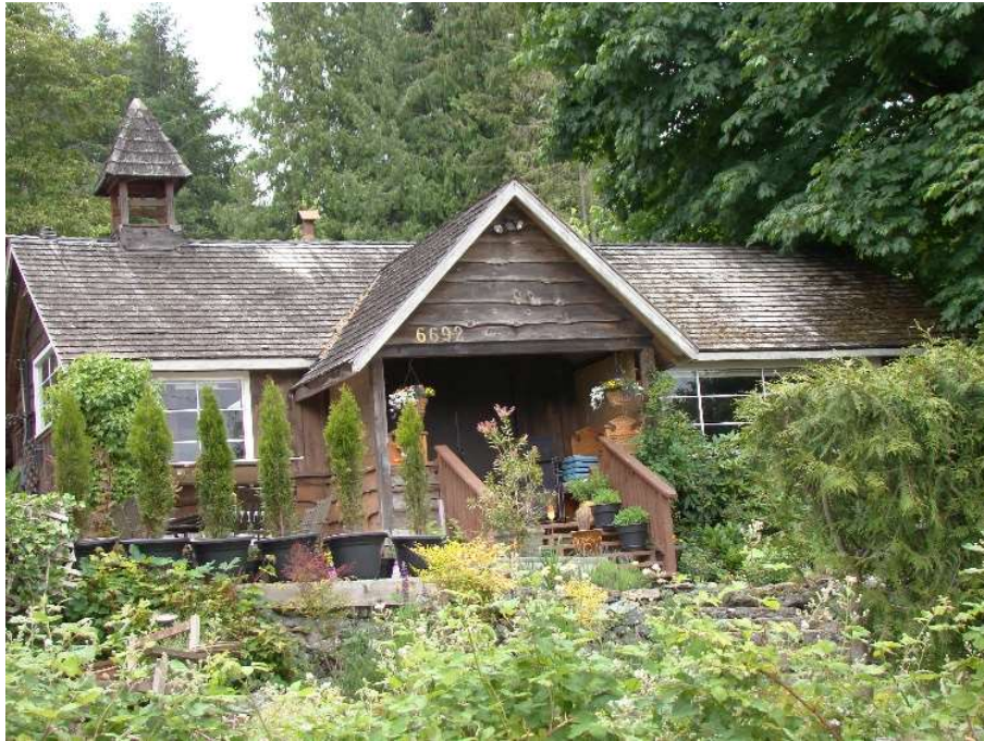
Former St. Peter's Church Hall as private home, 2012 (since demolished and replaced)

37. Second Maple Bay School Four-room public school opened 1961 with 161 students in grades 1-7. Two more classrooms and a gymnasium added in 1963. Closed in 2000. Property sold. School building now serving as private museum. Location: 6759 Considine Road in Maple Bay.