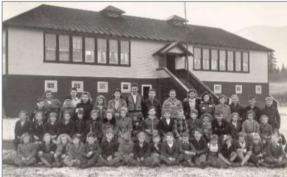
Caycuse School, 1943