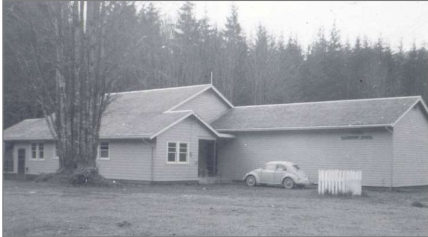
Nitinat School, April 1967