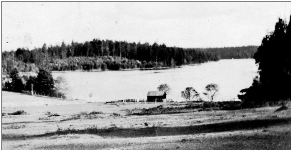
First Thetis Island School. c. 1920