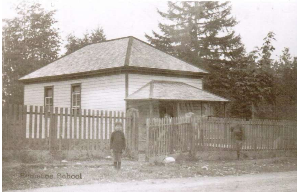
2 nd Somenos School, c. 1910