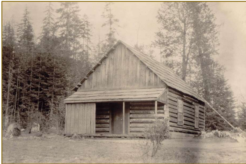
2 nd Sahtlam School, 1919