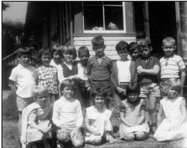
St. Christopher's Kindergarten, c. 1970