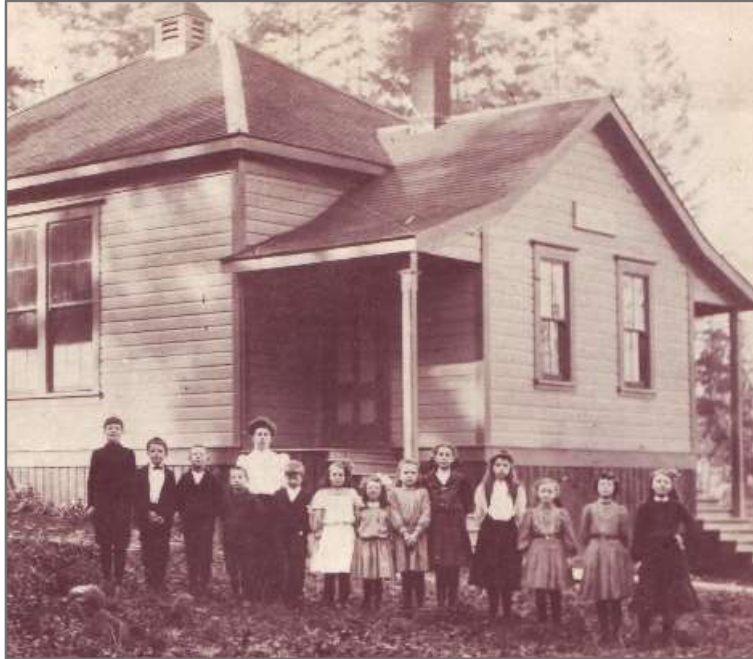
First Crofton School, 1907