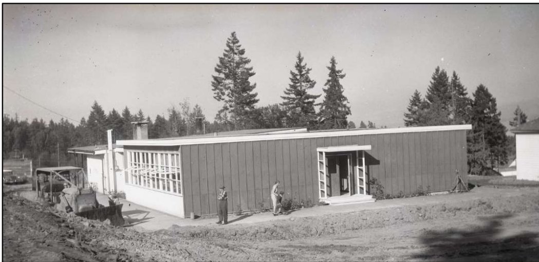
Second Crofton School, 1950 (First Crofton School on the right)