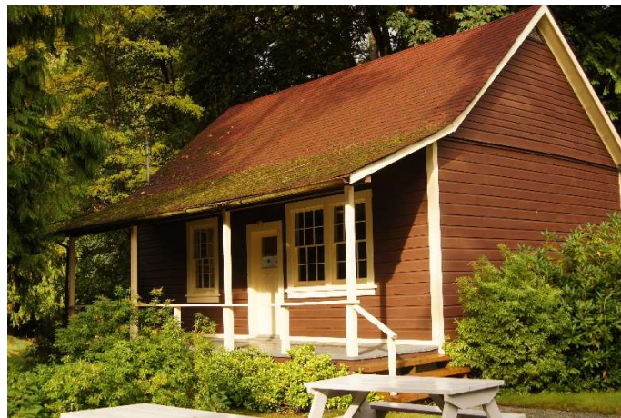
2 nd Cowichan Station School, 2013