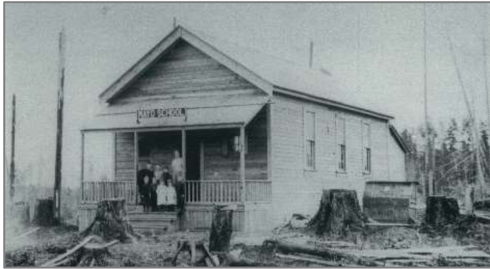
Mayo School, 1938