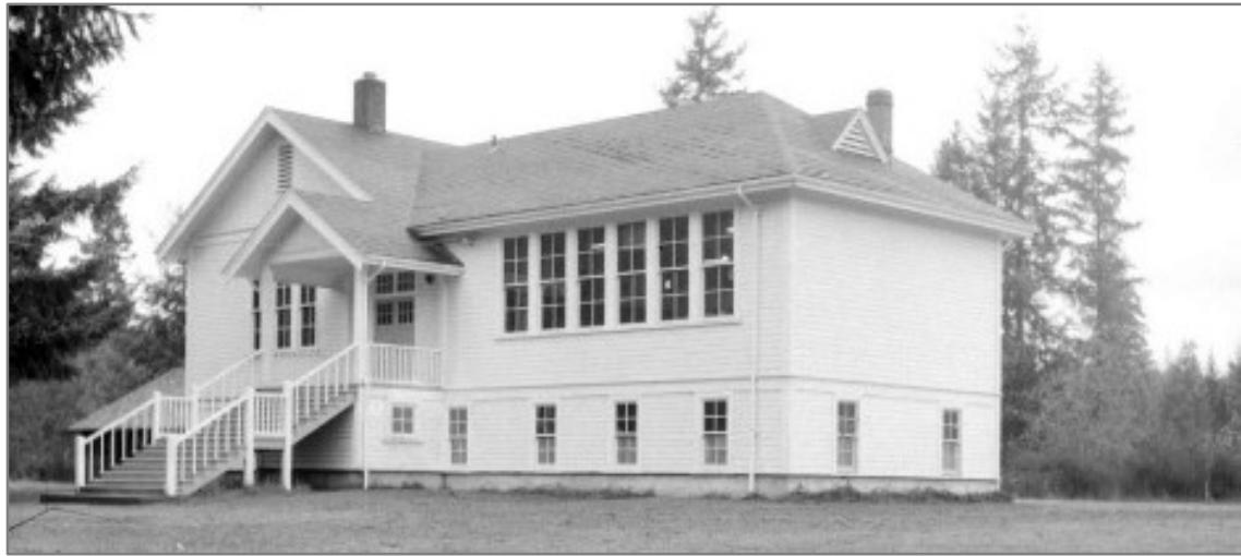
Cobble Hill High School, c. 1953