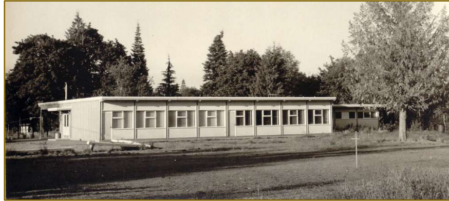
Gibbins Road School, c. 1962