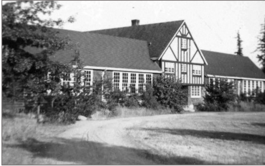
Prince of Wales Fairbridge Farm School, c. 1946