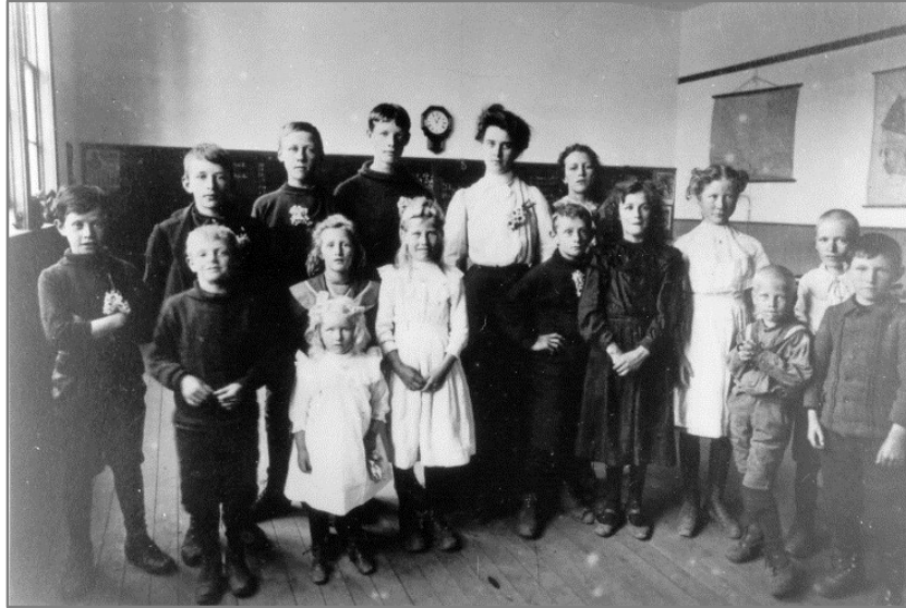
Oyster School, c. 1906 (later called Saltair School, then Mount Brenton School)

26. Mount Brenton Elementary School Opened 1885 as Oyster School. Later called Oyster Bay School. New schoolhouse was built 1905. Closed 1934. Re-opened 1948 as Saltair School. In 1950 re-named Mount Brenton Elementary School. Closed in 2002. Property sold 2004. Now last schoolhouse on site serves as Mount Brenton Community Centre. Location: 3850 Oyster School Road, Saltair.