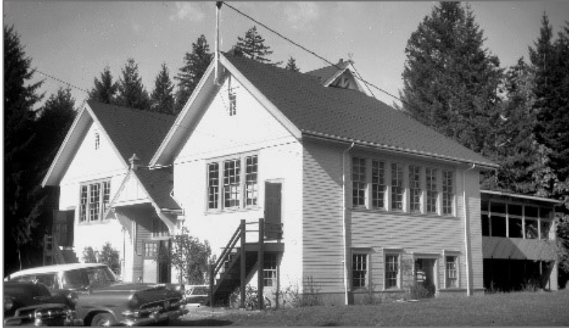
Cowichan Station School, c. 1960