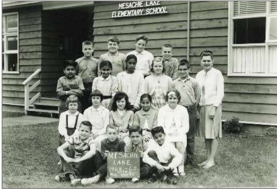
Mesachie Lake Elementary School, 1964