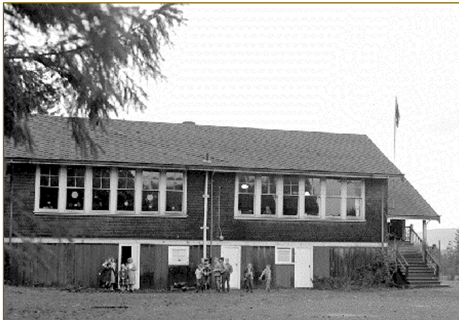
Sylvania School, 1953