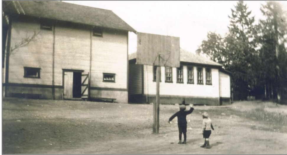
Shawnigan School, c. 1930