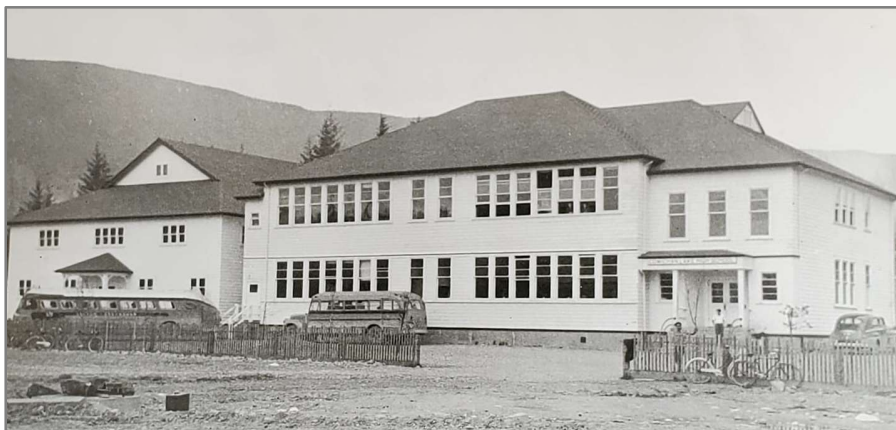
Cowichan Lake Superior School on the left, 1945