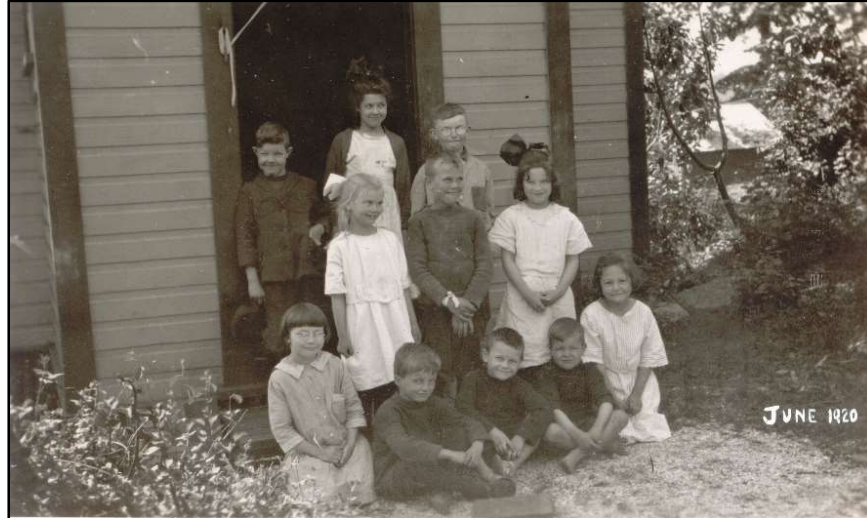
Genoa School, 1920