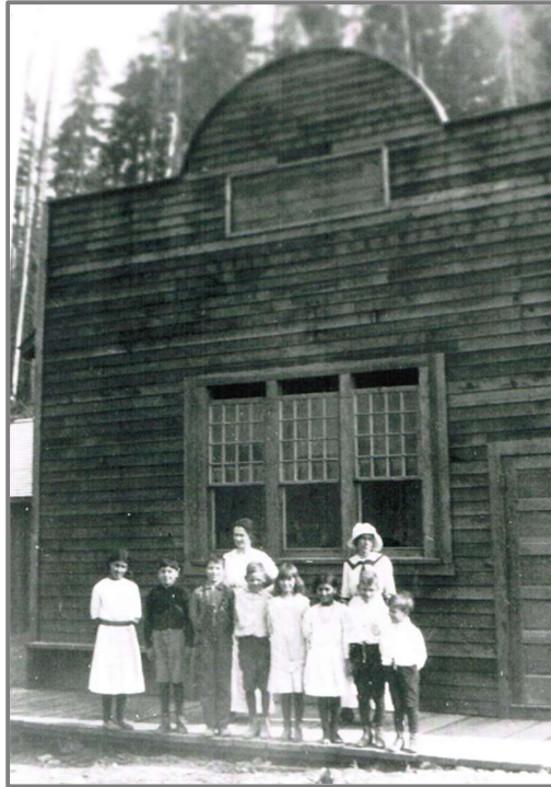
Beech Hall, c. 1913